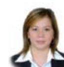
Lags 050 659 5688 (TAG)